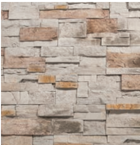
Chablis (Modern Stack)