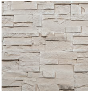
Chianti (Modern Stack)