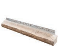
Chisel Face Sill