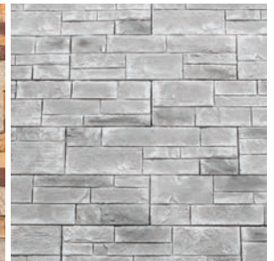
Winter (Classic Ledge)